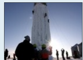
Cedar Falls Ice Silo Climbing

Besides ice climbing, Sundown Ski Resort is having some great skiing weekends lately. The snow is fluffy and there is lots of it to make skiers very happy.